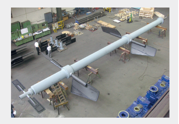
Agitator for a 6,500 m³ storage tank