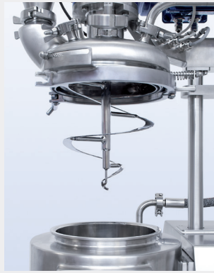
VST: EKATO Solids-PARAVISC

As a special feature, almost all available impellers can be provided on demand, including but not limited to double helix, archimedes screw and hydrofoil liquid impellers.