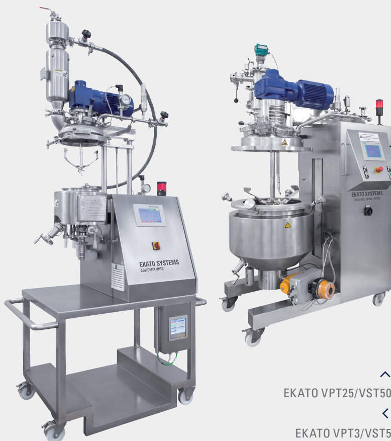
↑ EKATO VPT25/VST50