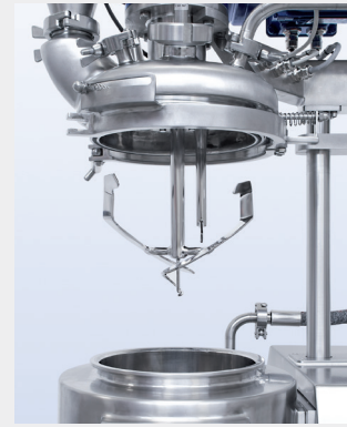
VPT: EKATO ISOPAS with baffle