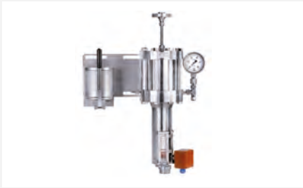
Pressure Compensator incl. handpump