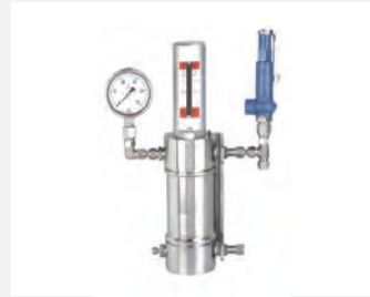
Pressure compensator VGD