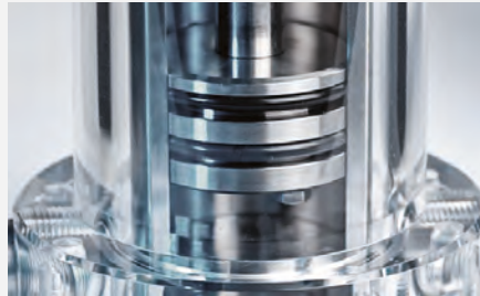
A glance into the interior of the pressure compensator