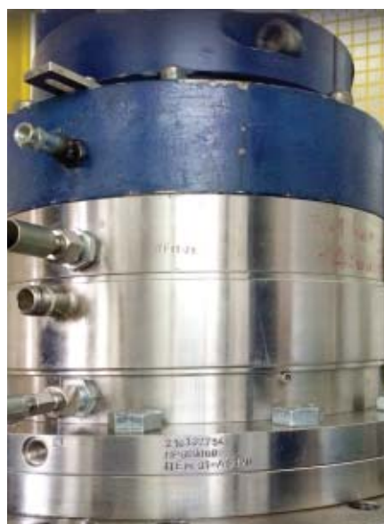
before repair 修理前