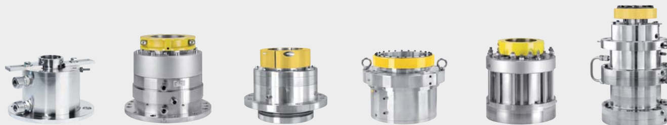
ESD 34 N