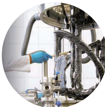
Mixing trials with customer products