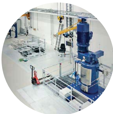
Equipment for safe scale-up