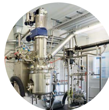
Pilot plants and units