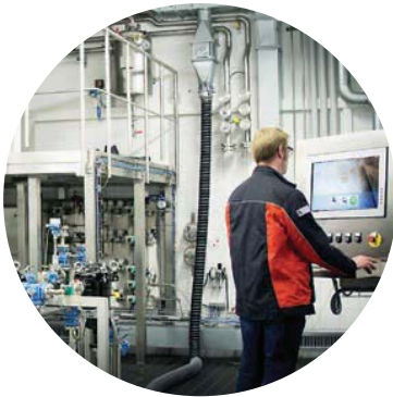
Hydrogenation test center